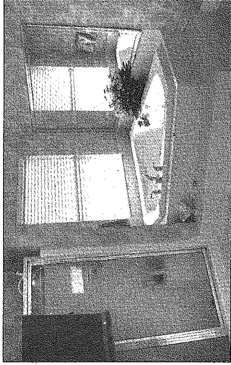
THE MASTER BATHROOM