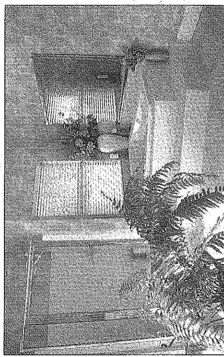
THE MASTER BATHROOM